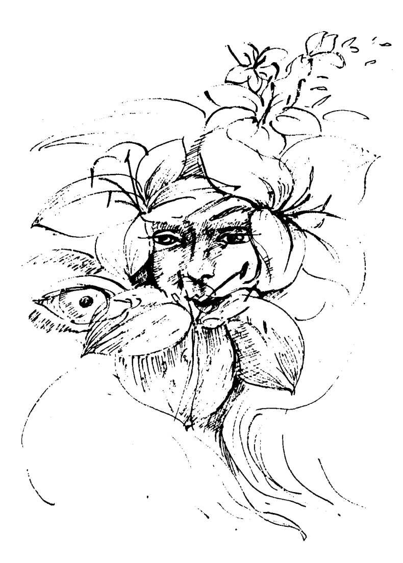
To see takes time, like to have a friend takes time.

This is what I have learned on my summer vacation. \Box