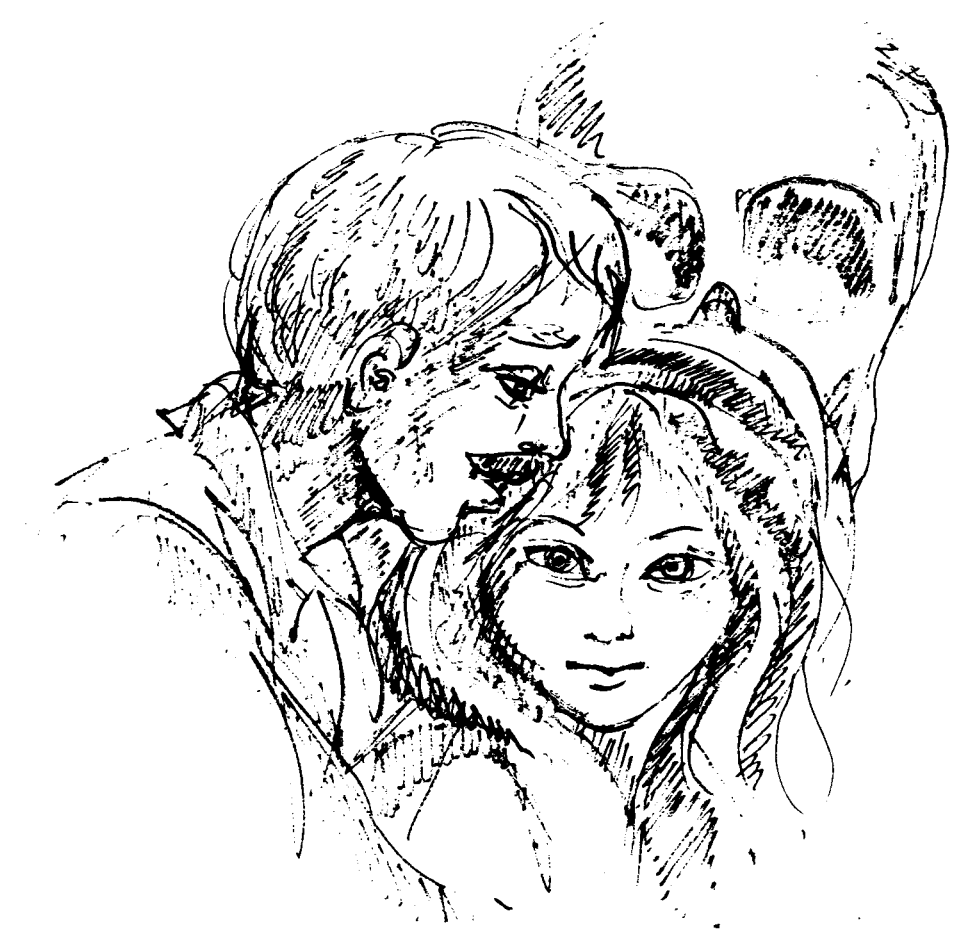
"All children should be cared for by the State"

The average Swede pays about 45 per cent of his income in direct tax, regardless of whether he or she is single or the family bread-winner. Separate taxation of spouses was introduced in the 1970's to encourage women to become financially independent.